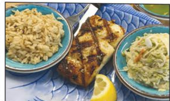
Grilled, fried, sautéed, steamed, the way you like it! Smoked plates, salads, sandwiches, chowder and the best fish & chips in North County.