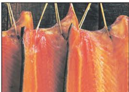
Our own smokehouse provides a wide selection of smoked fish.