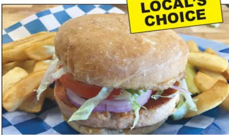
Big John SALMON BURGER $9.49 10 oz. salmon patty with fries and a drink.

North County's widest selection, finest quality and most competitive prices. We have a live lobster tank and a live Dungeness crab tank. Try some of our many types of smoked fish. We smoke our own! And, for our guests with selective palates we have a fresh caviar display filled with the freshest caviar from around the world.