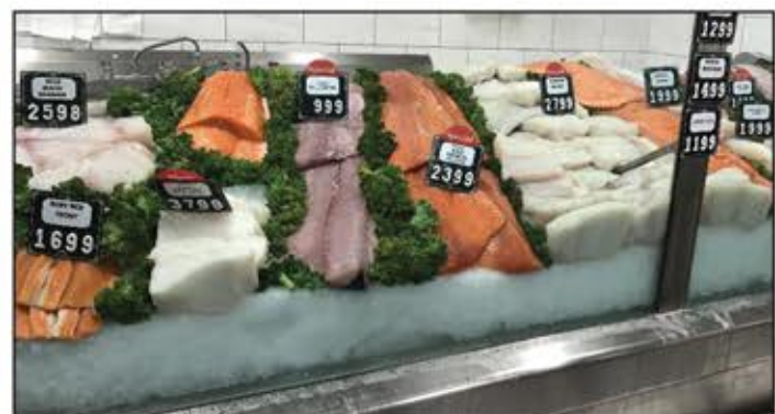
FRESHEST FISH Stocked Twice Daily