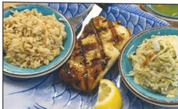
Grilled, fried, sautéed, steamed, the way you like it! Smoked plates, salads, sandwiches, chowder and the best fish & chips in North County.