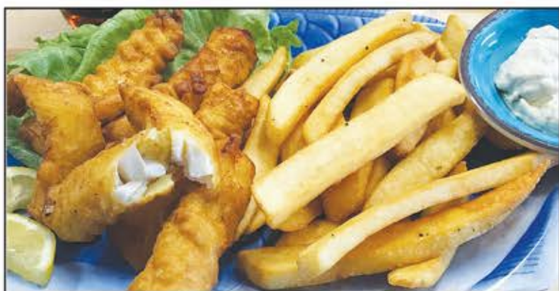
Fish & Chips $9.69 Beer battered Alaskan Cod served with steak cut fries

North County's widest selection, finest quality and most competitive prices. We have a live lobster tank and a live Dungeness crab tank. Try some of our many types of smoked fish. We smoke our own! And, for our guests with selective palates we have a fresh caviar display filled with the freshest caviar from around the world.