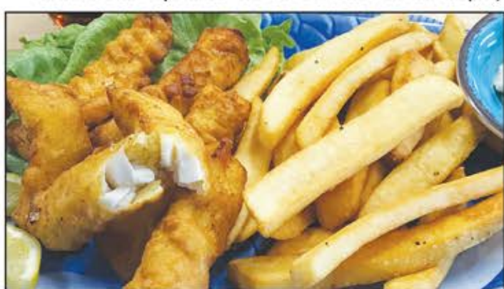
FISH & CHIPS $9.69 Beer battered Alaskan cod served with steak cut fries

North County's widest selection, finest quality and most competitive prices. We have a live lobster tank and a live Dungeness crab tank. Try some of our many types of smoked fish. We smoke our own! And, for our guests with selective palates we have a fresh caviar display filled with the freshest caviar from around the world.