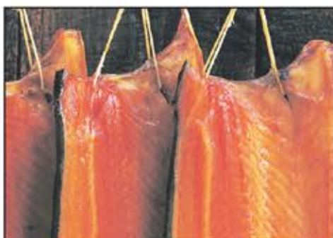
Our own smokehouse provides a wide selection of smoked fish.