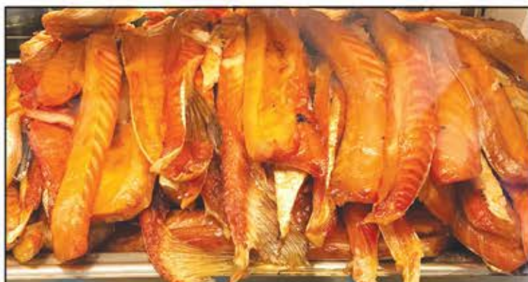
SMOKED SALMON BELLY Buy 3 lbs. and Get 1 lb. FREE