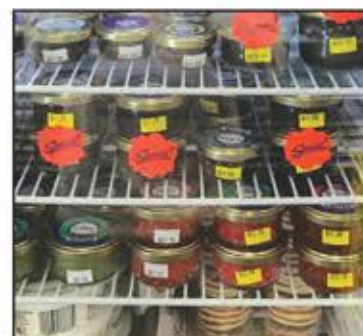
Caviar from around the world.