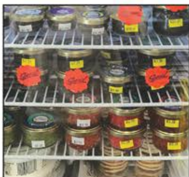
Caviar from around the world.