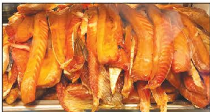
SMOKED SALMON BELLY Buy 3 lbs. and Get 1 lb. FREE